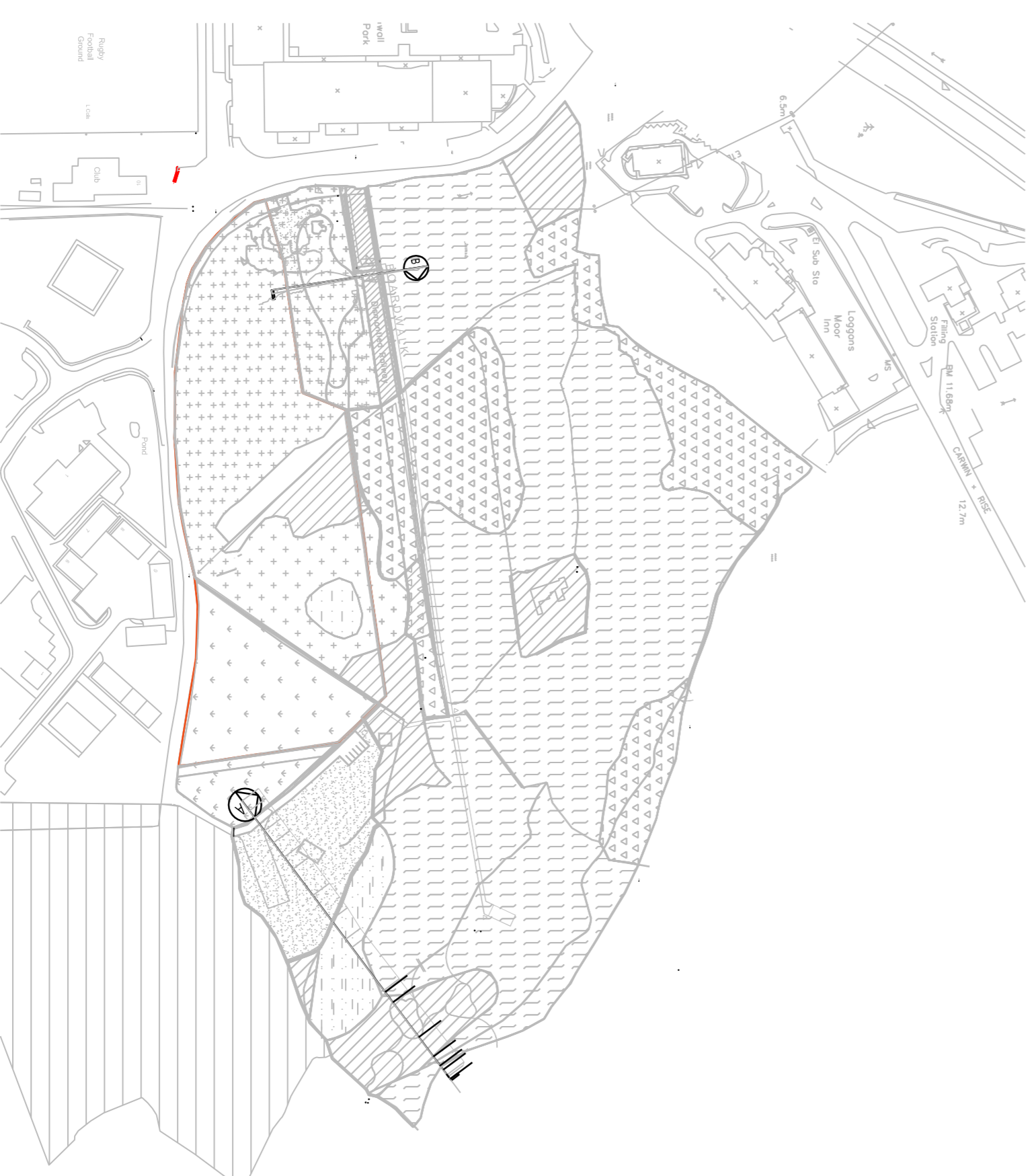
REFERENCE PLAN NTS