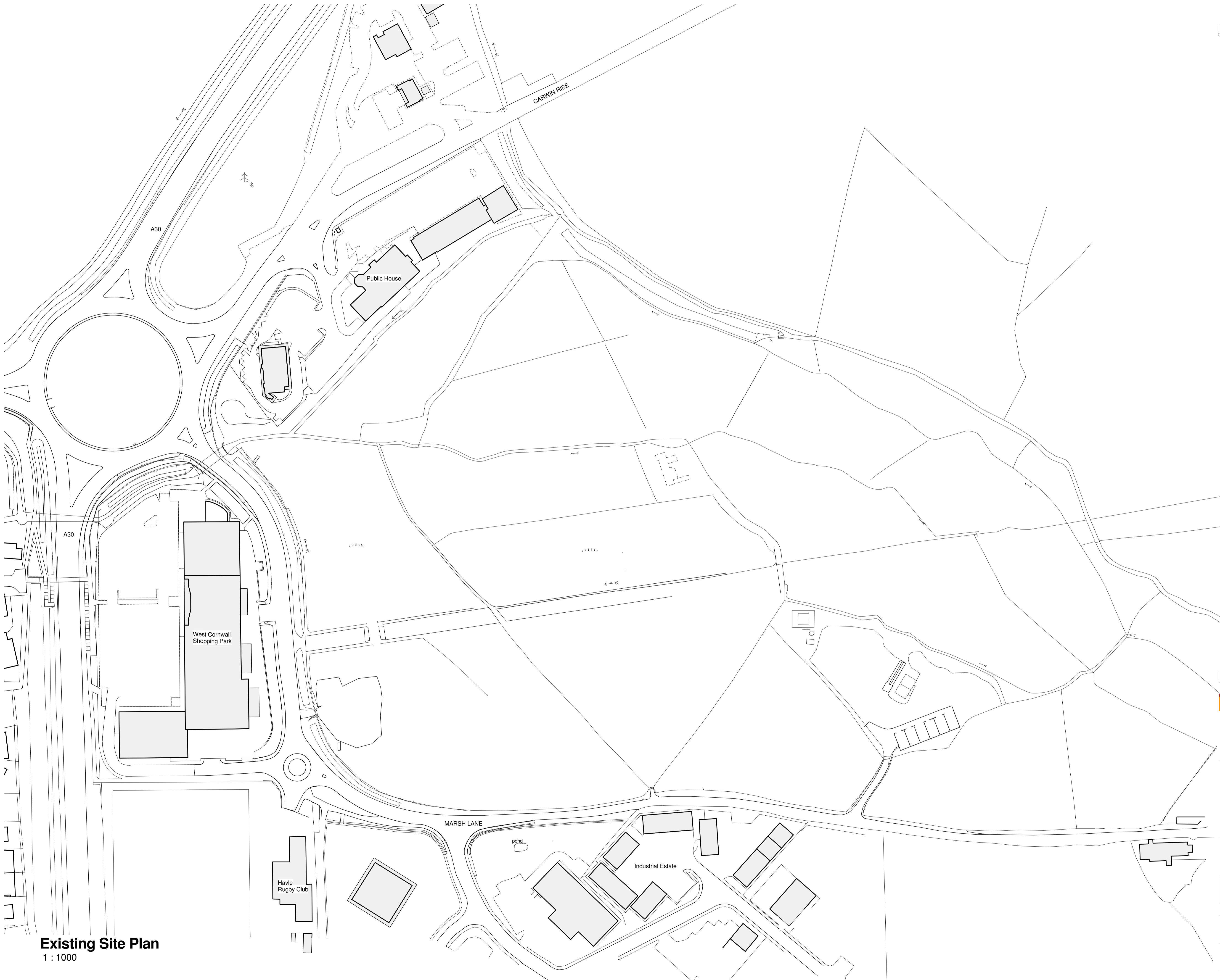
Existing Site Plan 1 : 1000